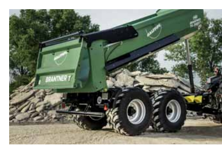
hydraulic pendulum flap Double-acting hydraulic rear wall opening with double function