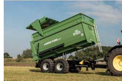
TA 20053/2 PT+ with conical trough, made of 4 mm thick sheet steel