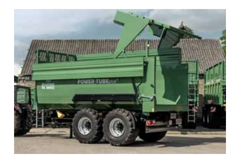
fold-down attachment walls Hydraulic rear wall can be opened when the top walls are folded down