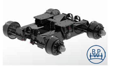
BPW pendulum unit with reinforced axles square 150 x 20 mm, brake 410 x 180 mm