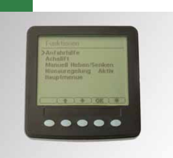
HP premium control Lift axle, starting aid, etc. (hydraulic suspension)

The absolute top model in the professional segment. Excellent suspension characteristics that protect the load and the vehicle against shocks and impacts.