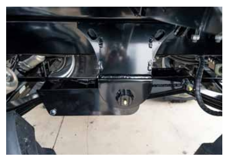
offset tandem unit Suspension on steering axle adjusted, better stability and reduction of the roll tendency