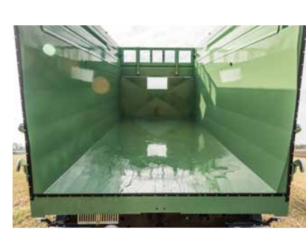
conical trough with absolutely smooth inner surfaces