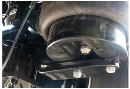
Air suspension with two-blade handlebars for optimum stability and off-road mobility