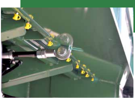
Innovation by Brantner Hydraulically controlled pendulum function for opening and closing

Dump truck reverse tipper with side tipping. Our dump trucks are also suitable for unloading on the side; depending on the customer's wishes, the version can be ordered on the left or right. This results in flexible use of the dump truck for silage, grain or wood chip transport.