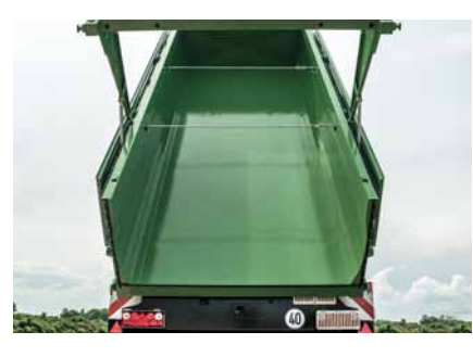
conical through for easier slipping of the load

TA 22053/2 XPT+ continuous 6 mm sheet steel, height 1000 mm